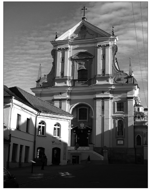
fig. 46 Church of St. Teresa in Vilnius, designed by Constante Tencalla, 1633–52