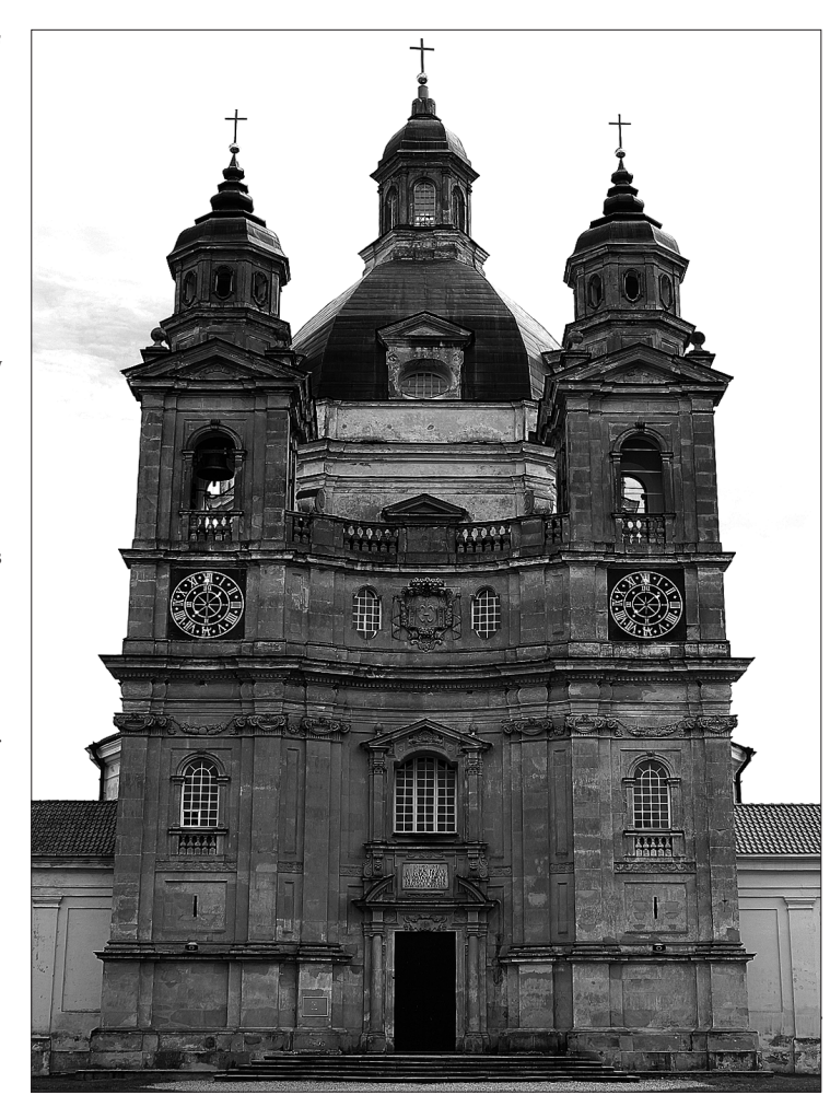
fig. 48 Façade of the church of the Visitation in Pažaislis, 1667–74, 1680s

More importantly, regardless of its similarity to the aforementioned buildings which may have inspired the design for the church at Pažaislis, the structure cannot be considered separately from an elaborate monastic complex which is a veritable Gesamtkunstwerk . The design of the Escorial, with its centrally located church framed by four courtyards, undoubtedly influenced the main concept of the Pažaislis complex. design in the church in Pažaislis does not share the shape of its Spanish counterpart, being modelled on the mausoleum at the Capella dei Principi (the Medici Chapel) at the church of San Lorenzo in Florence. The founder of the Camaldolese church, Krzysztof Zygmunt Pac, who in his youth received education at the court of the Medici and remained in touch with the family in later life, obviously knew about that. The similarity indicated not only the Grand Chancellor of Lithuania's political ambitions and artistic interests, but also a clear association with